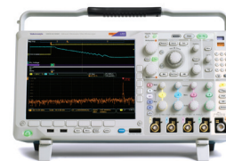
MD04000C Series Oscilloscope